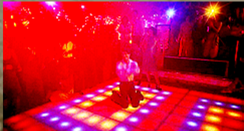
Saturday Night Fever (1977)