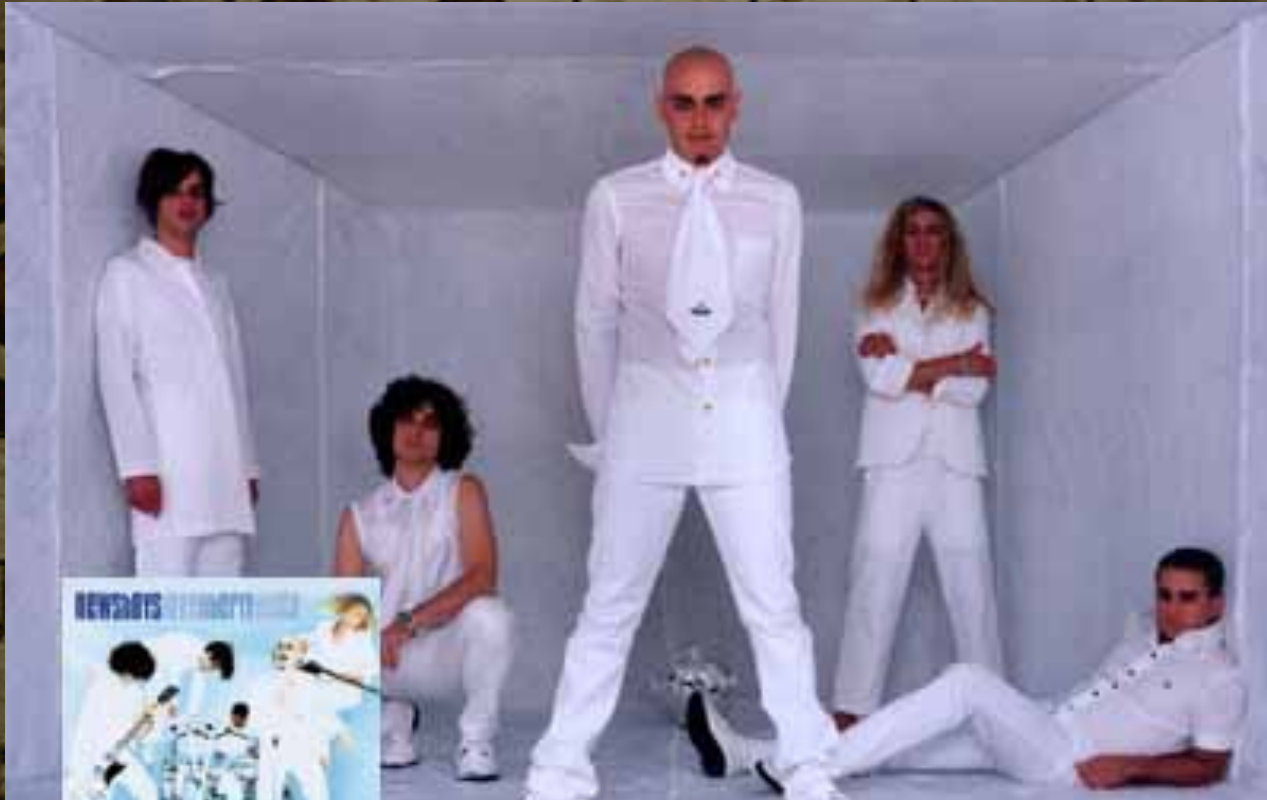
The Newsboys with the disco-inspired “Love, Liberty, Disco”: https://www.youtube.com/watch?v=zjKezlh2aW8