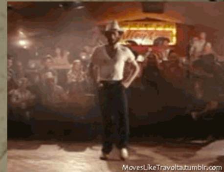
Urban Cowboy (1980)