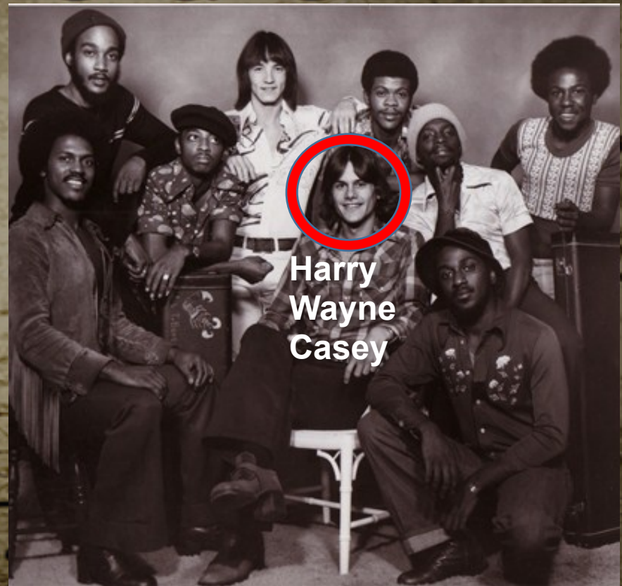
Harry Wayne Casey

Disco Disco Disco Disco Disco Disco Disco Disco Disco