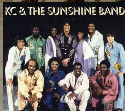
KC and the Sunshine Band