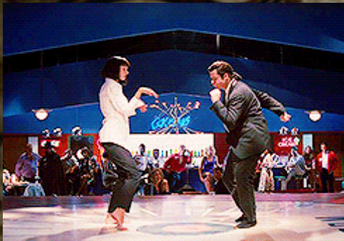
Pulp Fiction (1994)