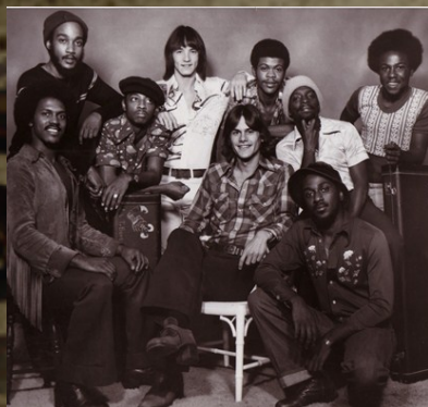
KC and the Sunshine Band